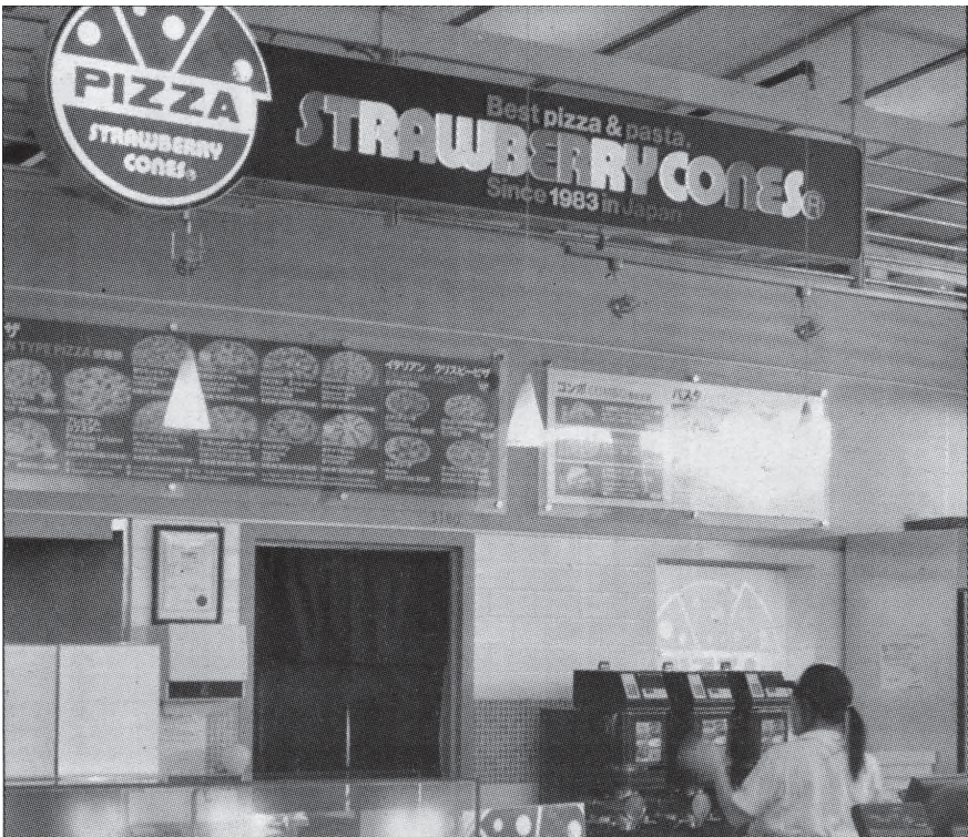
Strawberry Cones in Aberdeen Centre is a one-of-a-kind place—at least in Canada.

Strawberry Cones is a Japanese sensation that recently made its way to Canada, care of Aberdeen Centre. If the name doesn't offer any clues that pizza and pasta are specialties here, the rainbow-coloured logo isn't much more help. On the menu? Salmon and Camembert, Premium Lobster and Teriyaki Mochi Chicken. We're still waiting for the fruit pizza.