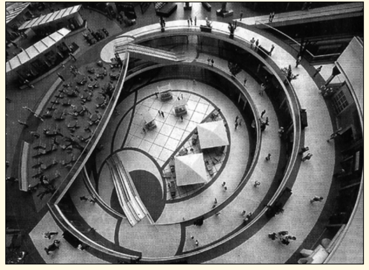
The central atrium of the new Aberdeen Centre will feature a special-effects light show that is touted to be the first of its kind in Canada

In its place and under construction is a reincarnated $100-million, three-storey, glass-enclosed Aber-deen Centre designed by Vancouver architect Bing Thom that will literally glow in the dark, lighting the way to an ethnically broader and less traditional-minded younger generation of shoppers. The new mall is, objectively speaking, a quantum architectural leap, but it is also an overture to attracting more than Asian shoppers. Of the 400 or so tenants expected to take space in the 380,000-squarefoot centre, about 60 per cent will be Asian and about 40 per cent non-Asian in spaces up to a relatively modest 12,000 square feet. Along with many of the former Asian tenants, including herbal tea shops, could be such quintessentially Western chains as the Gap, Ba-nana Republic, Radio Shack, McDonald's and Vancouver-based Aritzia, all of which are eyeing space in the new mall. Developer and owner Thomas Fung considered expanding the Aberdeen Centre in 1996, but Mr. Thom persuaded him to build a new shopping centre on virtually all of the six-acre site, with an attached four-level, 1,200-car parking garage. Mr. Fung is chairman and chief executive officer of Vancouver-based Fairchild Group, a Chi-