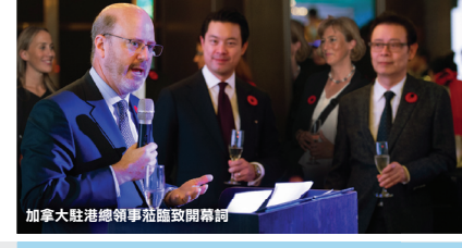
加拿大駐港總領事蒞臨致開幕詞